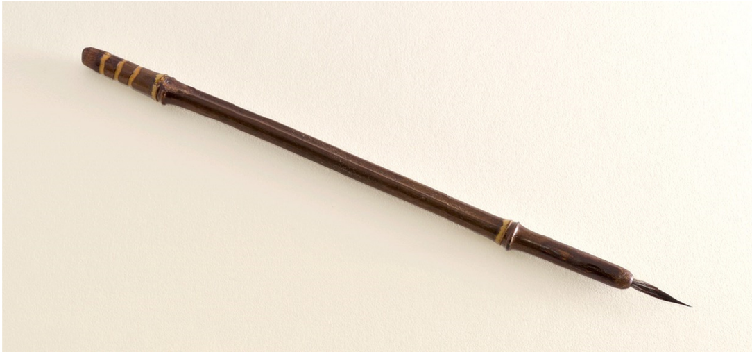
(Silver Fox brush)