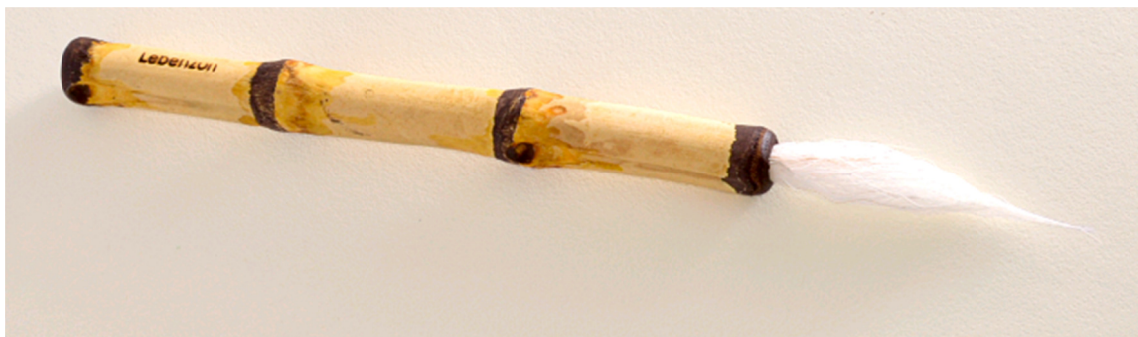
(Deer hair drip brush with Wangi handle )

Lebenzon Paintbrushes offers a full range of brushes that are designed for potters. Some options for pottery related brushes are mounted on very durable Wangi handles and include bristles that will produce both the finest strokes and deal with the heaviest and most abrasive materials around. Many of the brushes have been designed in collaboration with feedback from the NCECA membership and a number of professional potters.