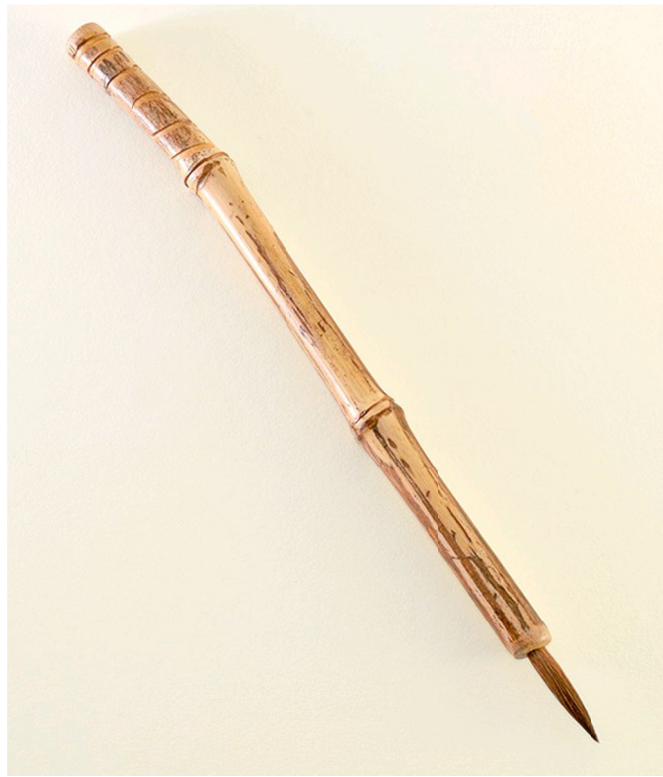
(Pony Hair brush)

anything else, and it can keep up with the fastest painters. Pony hair is very soft, so this brush is ideal for those who have a fast hand and light touch (pony hair brush below).