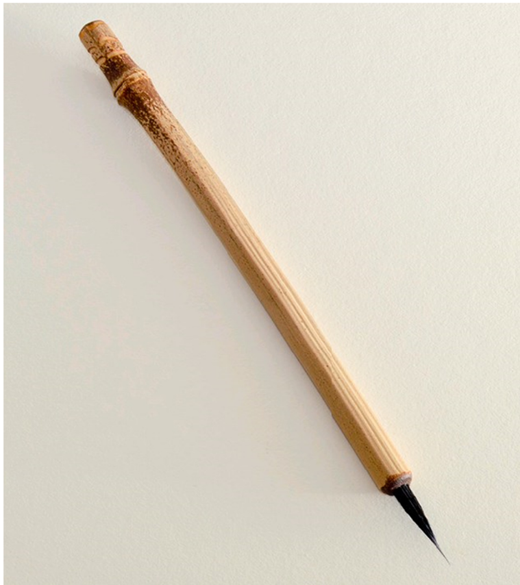
(Goat and Synthetic Blend brush)

Tracy experiments a lot with different hair types. This has led to several revolutionary brush designs. For instance, Tracy blends about 10% soft fine diameter synthetic filaments with double dressed goat hair to produce a brush with a hair fine tip that's easy to use, and which uses the goat hair to hold more fluid. This is named the Goat and Synthetic Blend. With this brush the artist has a brush that holds a lot of paint or ink and is easy to use on the tip and anywhere else. This brush empowers anyone to produce very finely nuanced work and focus on the work without having to dip the brush too often. The Goat and Synthetic Blend is among the company's most popular.